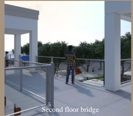
Second floor bridge

“Let the little children come to me and do not hinder them,” said Jesus. The discipleship of children is essential to our church’s ministry. The design of the new children’s wing reflects this.